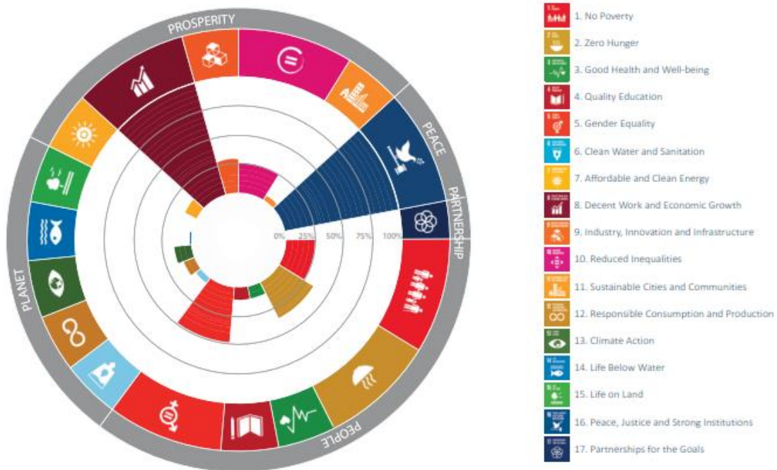
Sarona's companies' contribution to the SDGs (as a percentage of the total number of companies)