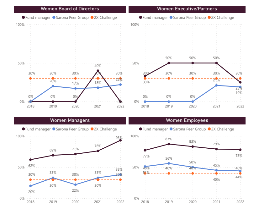
Figure 1. Sample image from a benchmarking report, illustrating the fund manager's historical performance against both the median peer group and the 2X global benchmarks. Data source: Sarona annual survey.

The takeaway: Observing market trends related to gender equality is crucial. The interest and capital allocation towards gender lens investing and women's participation and leadership in business has grown. Measuring progress at these indicators reflects the fund managers' contributions to SDG 5 (Gender Equality).